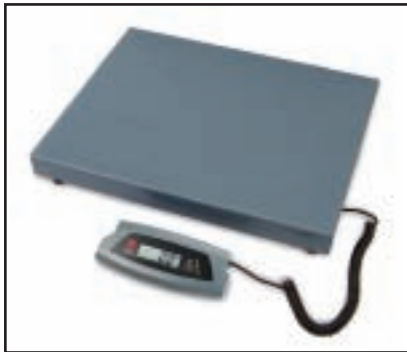
165lb and 440lb models available with large platform