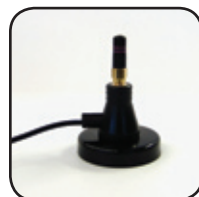
ZebraNet Internal Wireless Plus optional tethered antenna