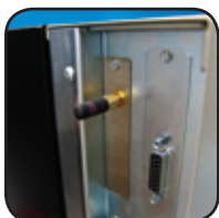
ZebraNet Internal Wireless Plus installed on a Zebra XIIIPlus printer