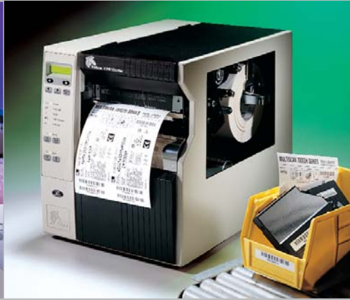
170XiIIIPlus™ 203/300 dpi

Label and liner width: 1.57"/40 mm to 5.51"/140 mm Ribbon width: 1.57"/40 mm to 5.1"/130 mm