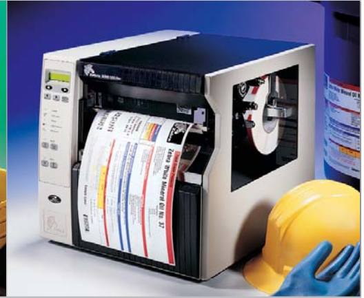
220XiIIIPlus™ 203/300 dpi

In North America, the 170XiIIIPlus has an RFID Ready option that allows you to upgrade to RFID technology in the future.